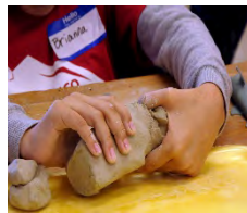
Hands shaping clay.