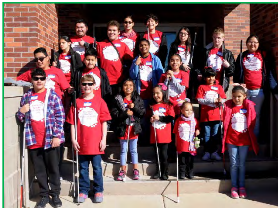
Group photo of the Braille Challenge participants.