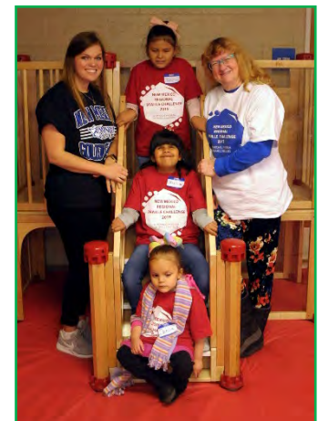
Group photo of the Enrichment participants.