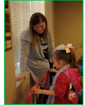
Dahlia finds a toy during a scavenger hunt.